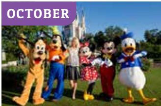
Orlando, FL October 16-19, 2023