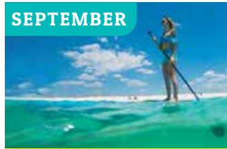
Pensacola Beach, FL September 12-15, 2023