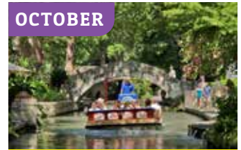
San Antonio, TX October 3-6, 2023