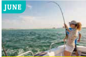
Destin, FL June 13-16, 2023