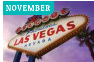
Las Vegas, NV November 14-17, 2023

To learn more information and additional event details, visit: