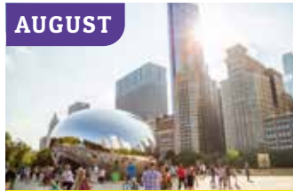
Chicago, IL August 29-September 1, 2023