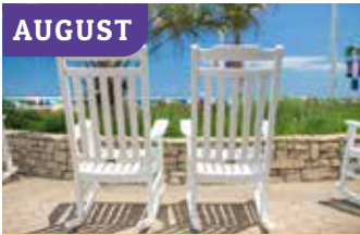
Virginia Beach, VA August 8-11, 2023