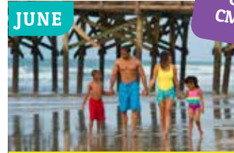
Myrtle Beach, SC June 26-29, 2023