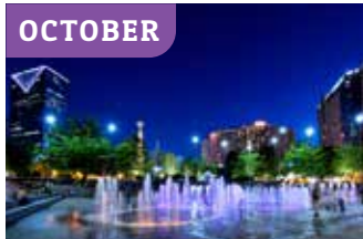
Atlanta, GA October 24-27, 2023