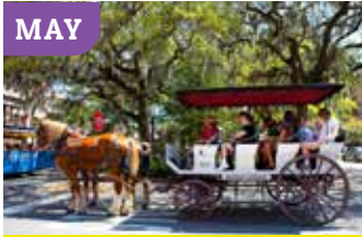
Savannah, GA May 1-4, 2023