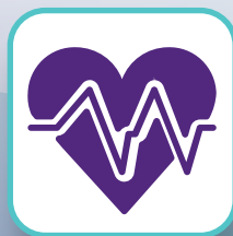
Cardiology & Emergency Medicine