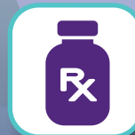
Pain Management & Pharmacology